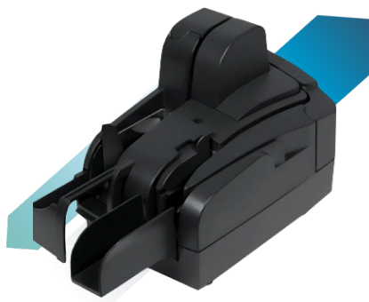
LS150 (Teller Check Scanner)

Sesami devices are renowned for their reliability, precision, and innovative features, catering to the dynamic needs of the banking and financial industry.