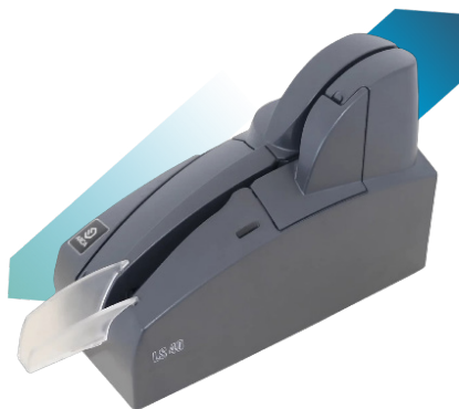
LS40 (Teller Check Scanner)

Ideal for teller counters and banking operations requiring high-speed cheque processing.